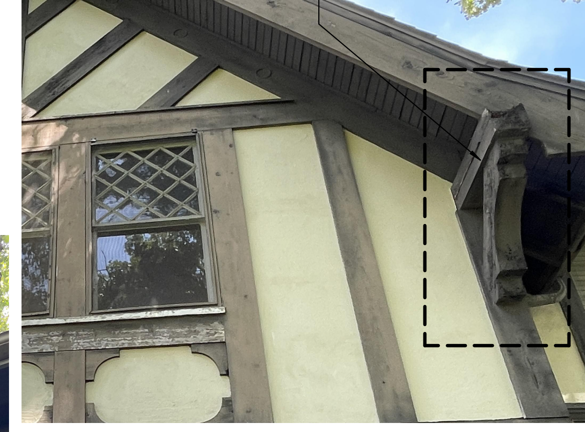
1D REFERENCE IMAGE 1 1/2" = 1'-0"

NOTE: DASHED LINE INDICATES AREA OF DEMOLITION WORK.