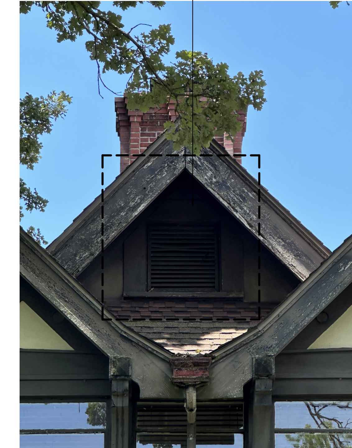
2B REFERENCE IMAGE 1 1/2" = 1'-0"

REMOVE LOUVER. PATCH AND REPAIR ALL EXISTING SURFACES TO REMAIN AND PREP FOR NEW CONSTRUCTION/FINISH.