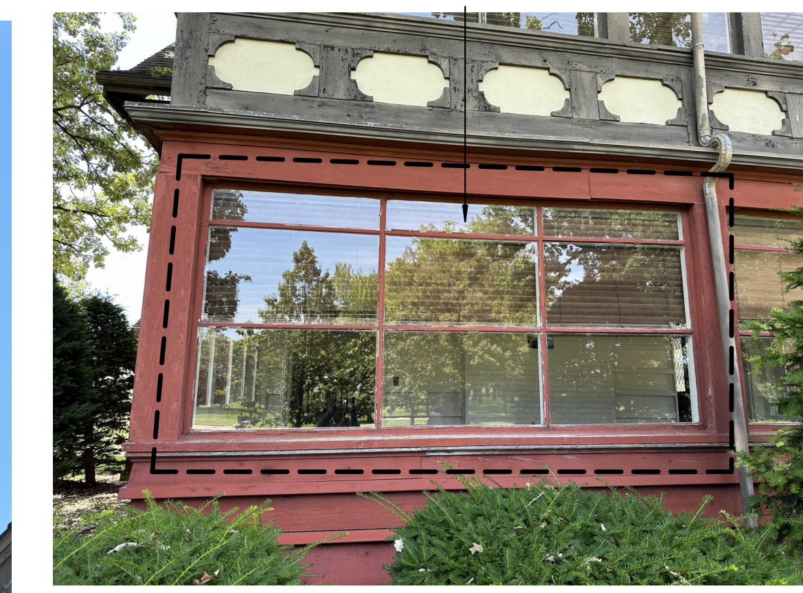
1B REFERENCE IMAGE 1 1/2" = 1'-0"

REMOVE WOOD DETAILS. PATCH AND REPAIR ALL EXISTING SURFACES TO REMAIN AND PREP FOR NEW CONSTRUCTION/FINISH.