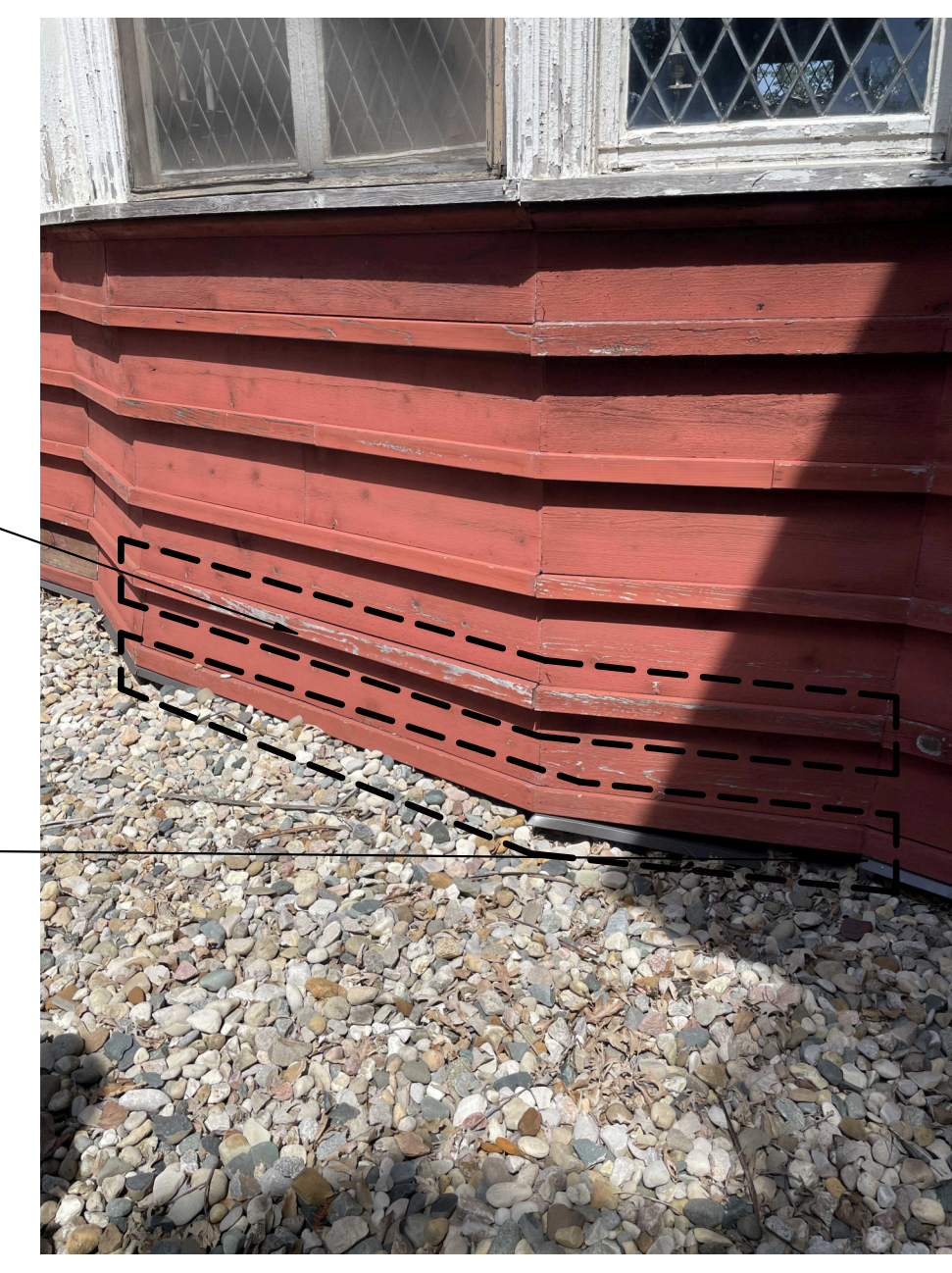
3D REFERENCE IMAGE 1 1/2" = 1'-0"

REPLACE CORNERS WHEN NEEDED. REPLICATE PROFILE, SIZE, AND DIMENSIONS OF THE EXISTING.