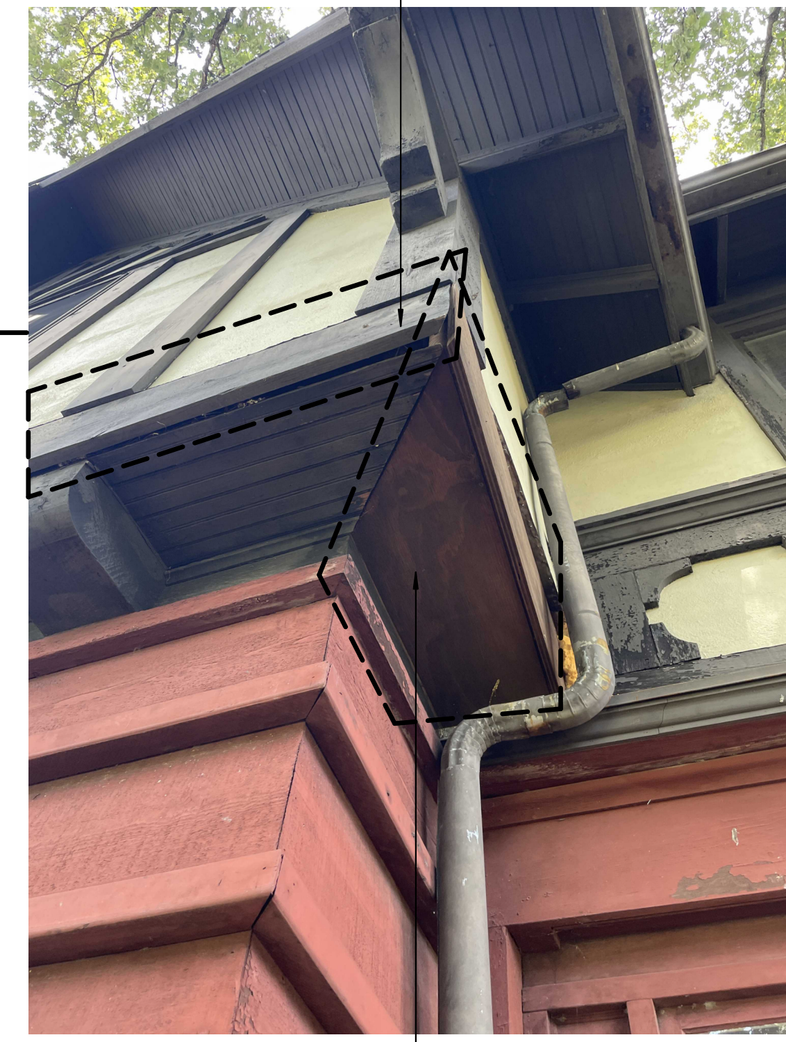
2C REFERENCE IMAGE 1 1/2" = 1'-0"

CLEAN BOARD AND REPLACE IF NEEDED TO MATCH THE PROFILE, SIZE, AND DIMENSIONS OF EXISTING SIDING BOARDS.