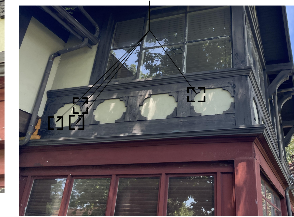
1C REFERENCE IMAGE 1 1/2" = 1'-0"

REMOVE ROTTEN BRACKET. PATCH AND REPAIR ALL EXISTING SURFACES TO REMAIN AND PREP FOR NEW CONSTRUCTION/FINISH.