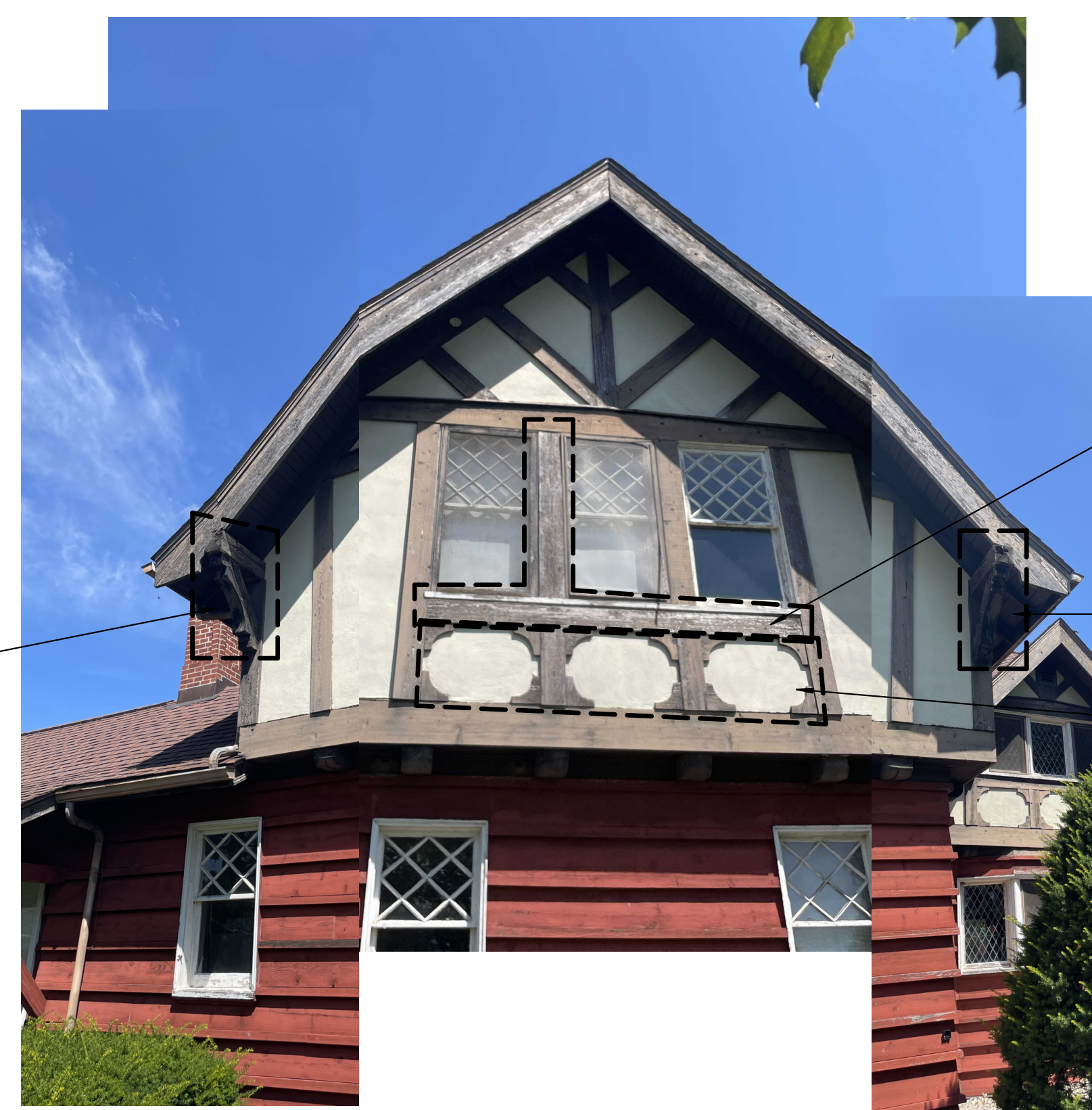
5C REFERENCE IMAGE 1 1/2" = 1'-0"

REPLACE SPLITTING BRACKET. REPLICATE PROFILE, SIZE, AND DIMENSIONS OF THE EXISTING.