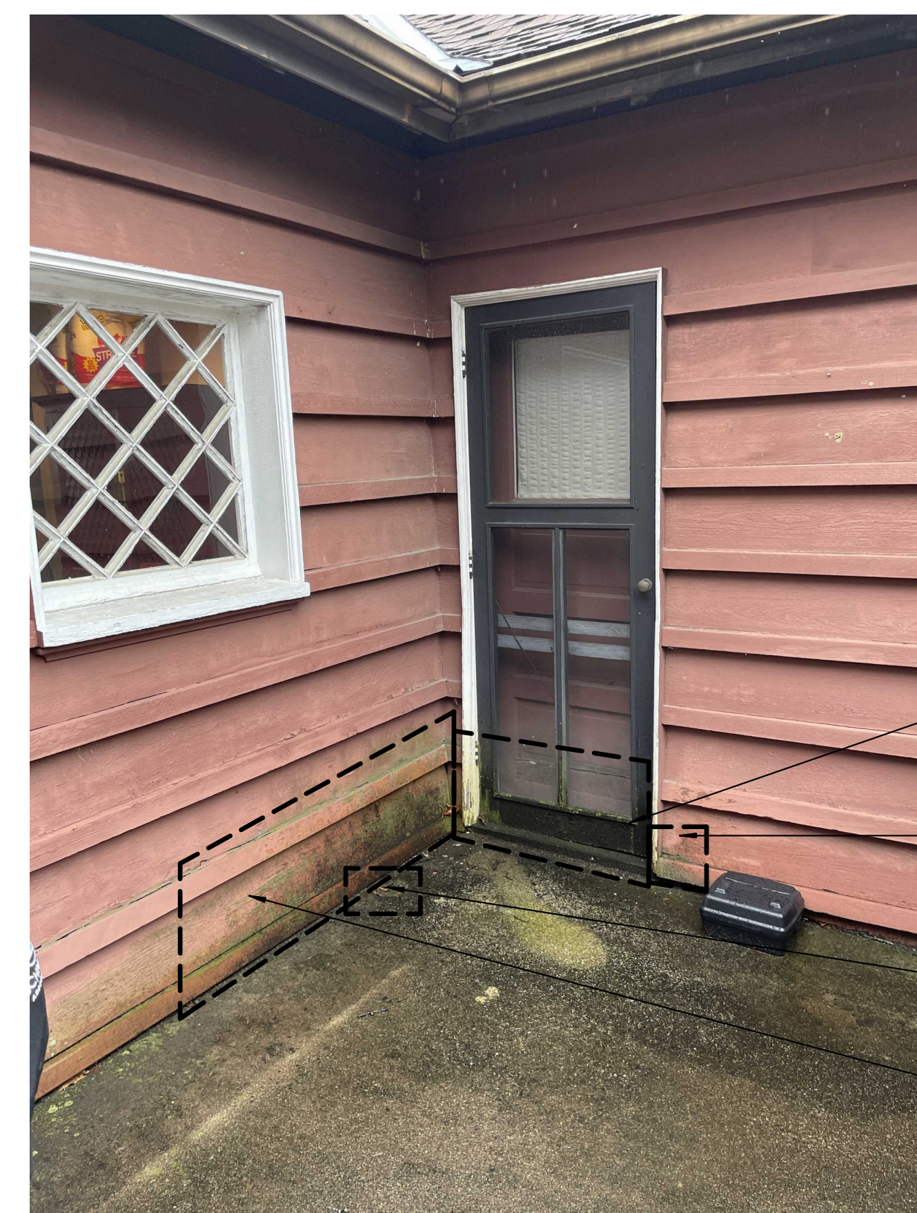
3C REFERENCE IMAGE 1 1/2" = 1'-0"

REFINISH SCREEN DOOR. REMOVE AND REPLACE ANY PIECES TO MATCH THE PROFILE, SIZE, AND DIMENSIONS OF THE EXISTING DOOR.