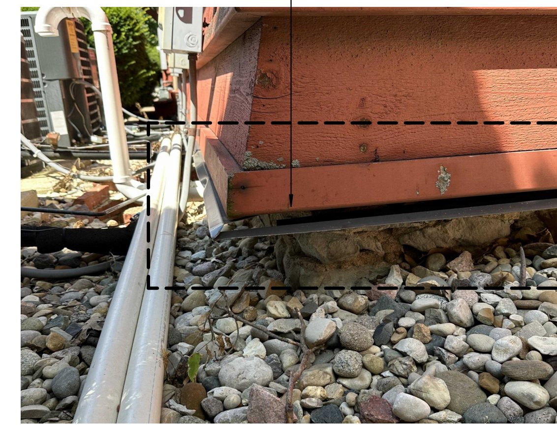
2A REFERENCE IMAGE 1 1/2" = 1'-0"

REMOVE FLASHING. PATCH AND REPAIR ALL EXISTING SURFACES TO REMAIN AND PREP FOR NEW CONSTRUCTION/FINISH.